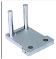
support plate (optional) suitable for short wrenches