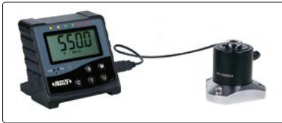
digital torque tester (optional)